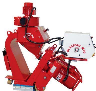
Steel & Concrete Deck Blasters

845 Woburn Street, Wilmington, MA 01887 Tel: 1-800-556-4456 / Fax: (978) 657-8740 E-mail: info@dawson-macdonald.com Website: www.dawson-macdonald.com