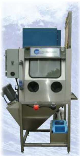
Wet Blasting/ Vapor Honing