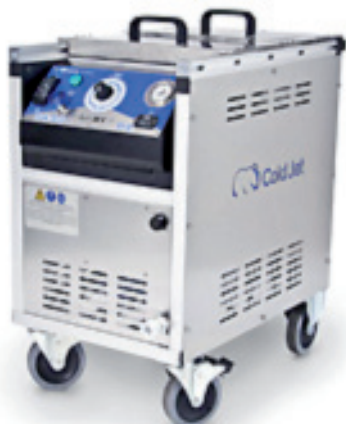
Dry Ice Blasters