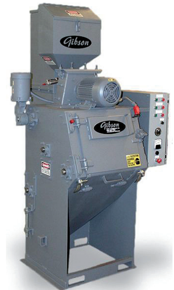
Wheel Blast Equipment