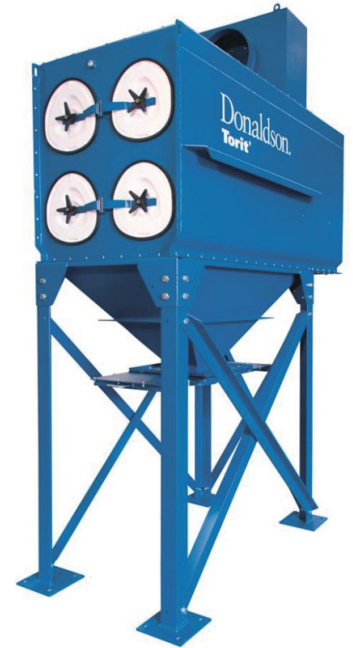
Dust/Mist/ Fume Collectors