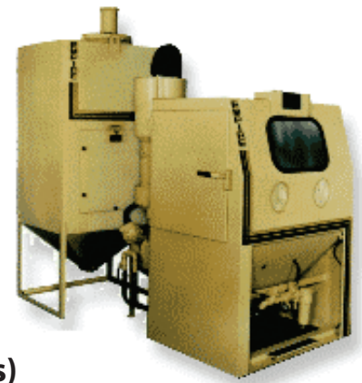
Hand & Automation Sandblast Cabinets